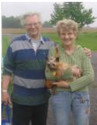
The Austins with 10 year old senior "Prince" on adoption day.